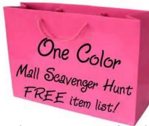
Shopping at weekend