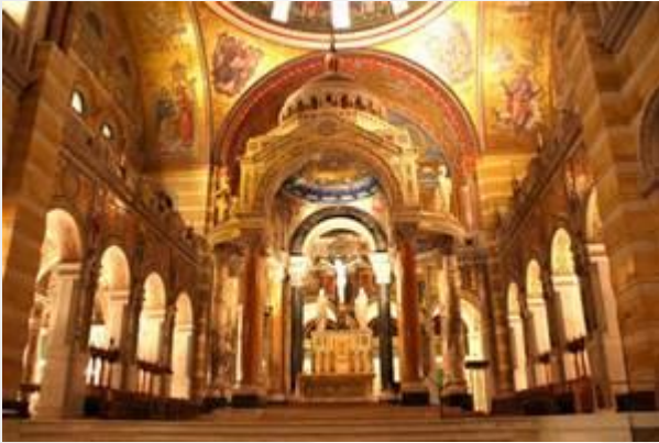
St. Louis Cathedral